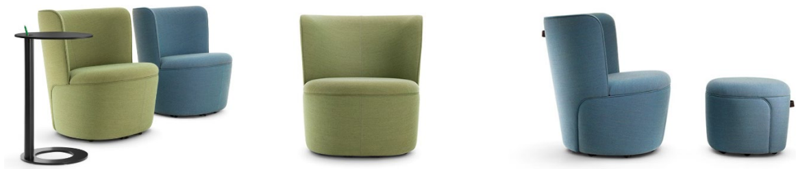
Cina lounge chair – complemented by the Tala side table (pictured left) and matching stool (pictured right)