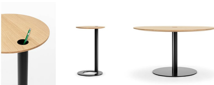
Tala with integrated round receptacle für writing utensils: as a side table and as a round table for small meetings