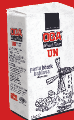
46 WHEAT FLOUR 5 KG