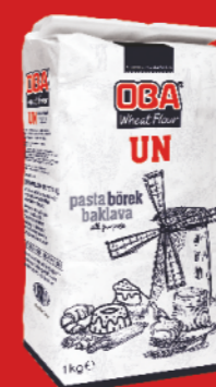
43 WHEAT FLOUR 1 KG