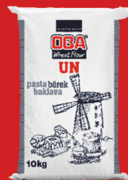
48 WHEAT FLOUR BAKERY 10 KG - 25 KG - 50 KG