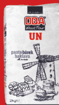
45 WHEAT FLOUR 2 KG