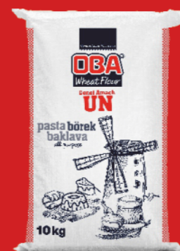
47 WHEAT FLOUR ALL PURPOSE 10 KG - 25 KG - 50 KG