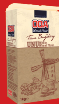
44 WHOLE WHEAT FLOUR 1 KG