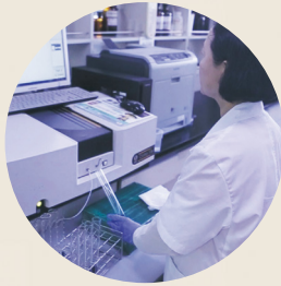
CONTINUOUS QUALITY STUDY