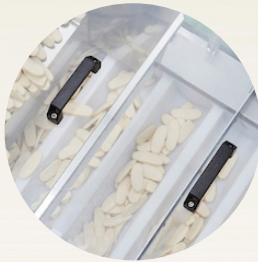
BLOCKING FOREIGN COMPONENTS