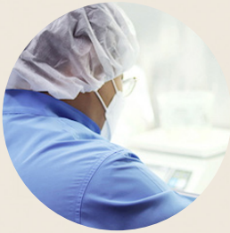
COMPLETE QUALITY CONTROL