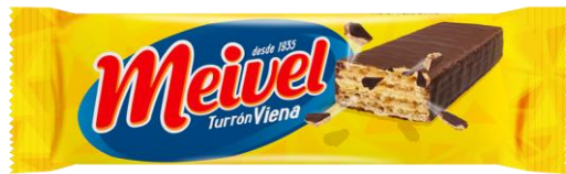
Turrón Viena 33g